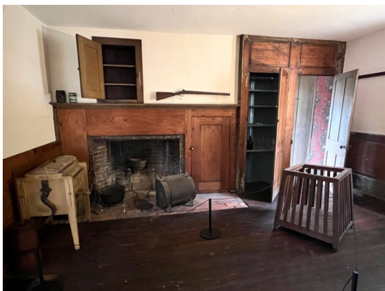
The kitchen with infant playpen

Well, you can probably guess this last paragraph was coming. We would like to ask for your financial support as you get to your end-of-year charitable plans. For current members, thank you for your continuing membership and support. For non-members, please consider joining the Boxford Historical Society and/or making a donation. We are a 501c (3) organization so your contribution is tax deductible. See the attached envelope, or you can make a contribution online at boxfordhistoricalsociety.org . and go to the Donations tab. The house is not heated during the winter months but we plan to have regular tours from April through October of 2026 on the first Fridays of each month from 1:00-5:00pm. The schedule will be posted online at the website in the spring. Special tours can be arranged anytime.